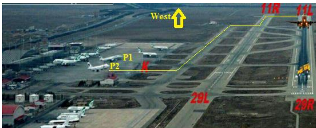
Figure2. Imam Khomeini Airport

In the other case, the headset man was told by the pilot to inform the pushback driver to move the plane to east (face east). Due to the accent of the foreign pilot, the headset man could not discern which direction the pilot requested. He passed the message wrongly to pushback driver and the plane was moved to the opposite direction. Later on, he proclaimed that he didn't recognized which direction the pilot said but he didn't ask for clarification. In this respect, maxim of quality has been violated in part of the headset man since he did not pass the message truly and therefore, miscommunication occurred.