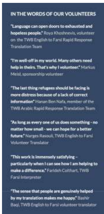
Figure 2: TWB – In the Words of Our Volunteers (accessed 25 October 2019)

Unlike charity, solidarity is reflexive and is able to critique itself (Rai 2018:14). Khasnabish (in press) highlights two further characteristics whose relevance to the current discussion will become clear. Solidarity, he explains, is “a transformative relationship for those involved in forging it, not a thing to be achieved; second, it is grassroots in nature and often constructed from the margins, not something imposed from above”. As such, many acts of solidarity are not sanctioned by mainstream institutions and may attract critical attention. Charity, on the other hand, is rarely treated as a potentially controversial act, and hence is more likely to escape scrutiny. So far, for instance, the limited literature on crowdsourced translation has focused on topics such as motivation (McDonough Dolmaya, 2012; Olohan, 2012, 2014) but has rarely engaged with its ethics or situated it within wider critiques of the platform economy and digital labour. Charity is also not a transformative relationship for those who offer it, as it is typically restricted to helping those in need without expectation