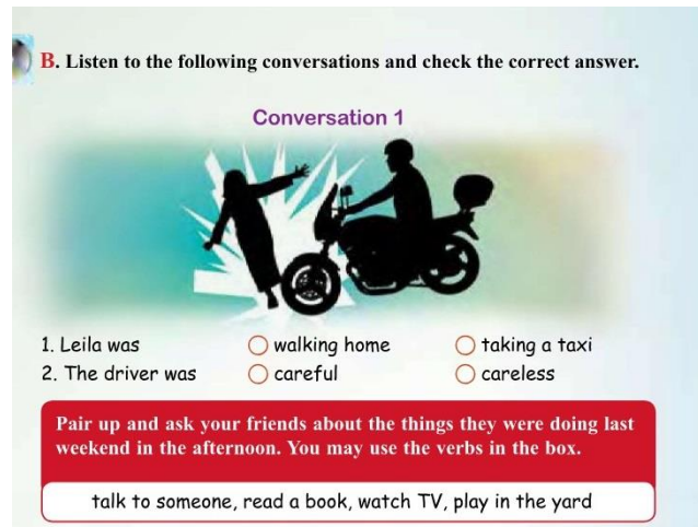
Figure 4. Extract from Vision 1; page 88

In the other book, Solutions E. , the distribution of exercises is more balanced in terms of adherence to the two versions of CLT. The image below illustrates four speaking exercises taken from the textbook Solutions E. This segment focuses on the theme of family and household responsibilities. One prominent feature of this page is the variety of speaking exercises, which provide numerous opportunities for students to practice their speaking skills.